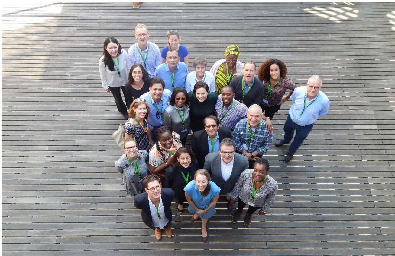
Gavi CSO Steering Committee, Barcelona, October 2017

Merci! Thank you! Danke! Obrigada! Shukran!