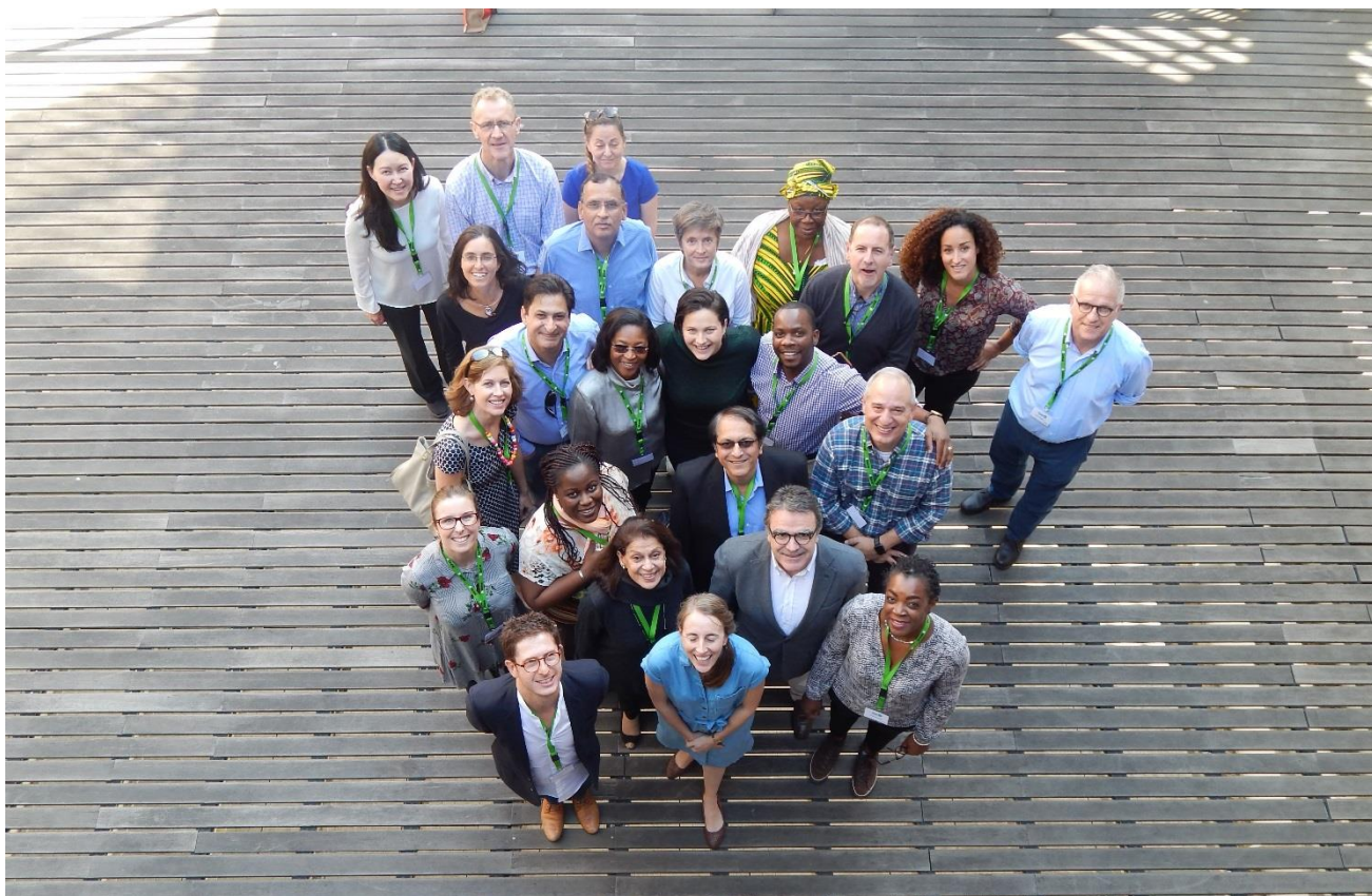
Gavi CSO Steering Committee, Barcelona, October 2017

Merci! Thank you! Danke! Obrigada! Shukran!